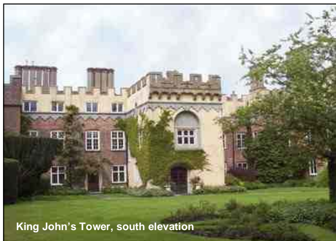
King John's Tower, south elevation