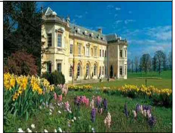
Springtime at Hartwell House, the delightful venue for the Society's AGM.

ISBN 978-0-57122703-7. Published 2007 by Faber and Faber.