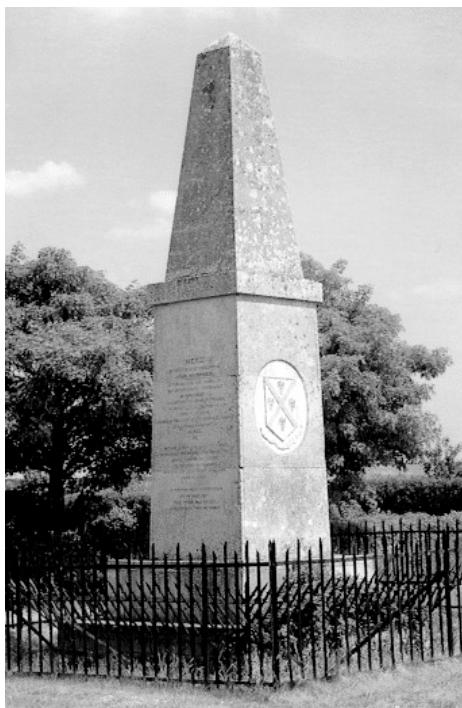
The Chalgrove Monument, which stands on the site of the battle and was erected in 1843 by Lord Nugent as a memorial to John Hampden

Acknowledgements to Computability of Hedge End, Southampton, and Gabletek of Great Shefford, Newbury, for technical assistance.