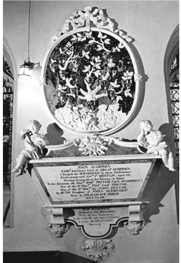
The Hampden Memorial in Great Hampden Church, now undergoing renovation