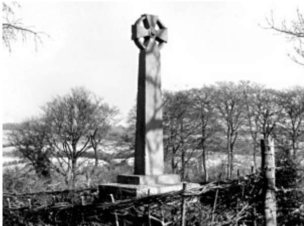
The Ship Money Monument, which stands on the land in Stoke Mandeville parish for which John Hampden was assessed 20 shillings.