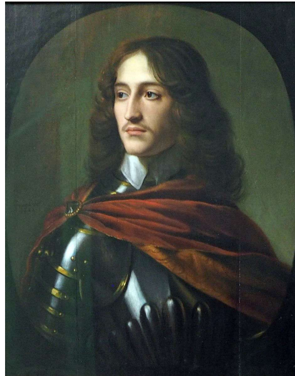
Portrait of Prince Rupert by Gerard van Honthorst

Legend often mistakenly holds that Prince Rupert accompanied King Charles to Parliament when the monarch attempted to arrest Hampden and the other five members in January 1642. However, it was Rupert's brother Charles who accompanied the King, because Rupert himself did not arrive in England until August 1642.