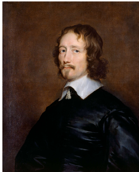
Portrait of John Hampden by William Dobson